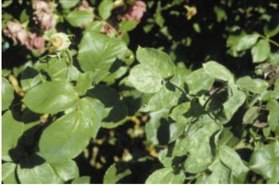
Figure 3.—Powdery-mildew-susceptible plant on the right; resistant plant on the left.