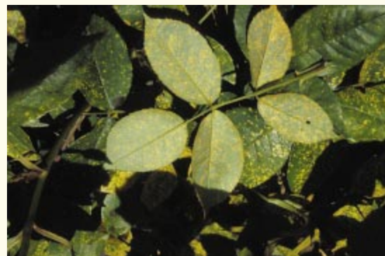
Figure 2.—Rust on both sides of rose leaves.

Spores of the fungus move from plant to plant on air currents. Newly emerging young leaves are the most susceptible to infection by the airborne spores. Within hours of landing on a leaf, spores germinate and grow into leaf tissues through natural openings.