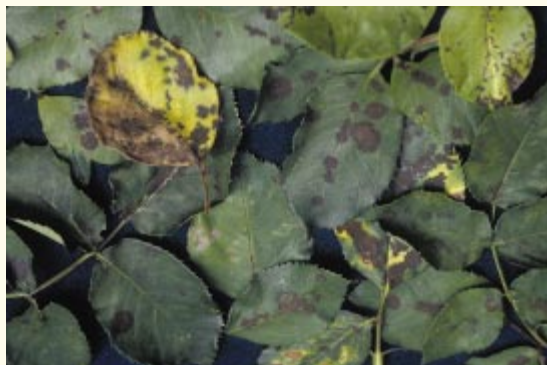
Figure 1.—Symptoms of black spot.