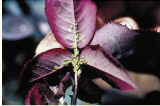
Figure 5.—Colony of aphids on underside of leaf.