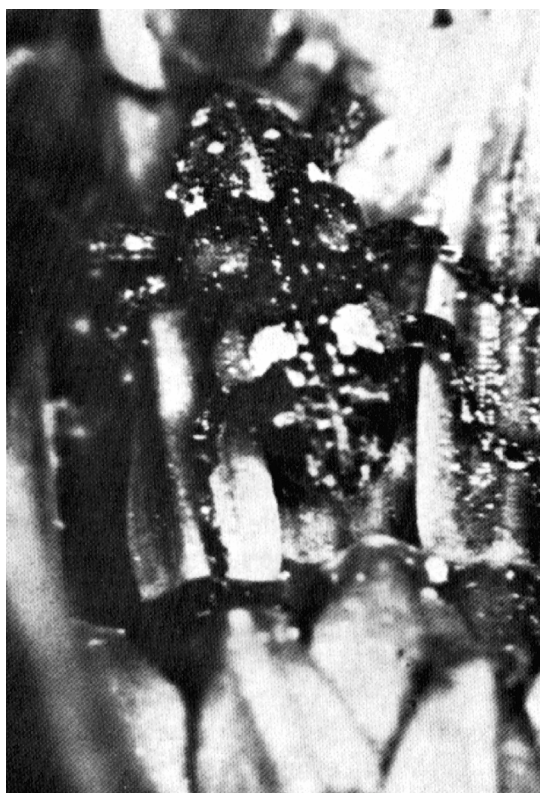
White pine weevil adult

Cyfluthrin is an effective weevil killer. There are several home garden insecticide products containing cyfluthrin registered for use on trees. Apply to previous year's "leader" or terminal in late spring to early summer. Pruning out and destroying infested tips from the tree in late summer or early fall before beetles emerge can also cut down reinfestation the following year. The shape of the tree can be partly restored by training a new leader to take the place of the dead one.