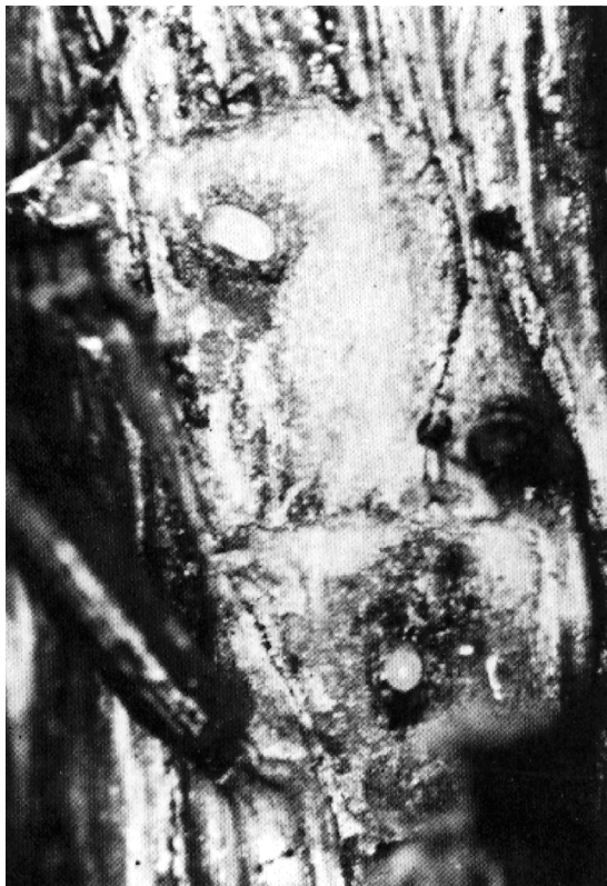
White pine weevil eggs

become active during late spring and early summer. During this time they feed on the tender bark of spruce or pine terminals, creating small cavities within which they deposit pearly white eggs. The eggs hatch in about 10 days and the small larvae bore through the bark, into the wood and down the stem. The larvae are curled, white, and legless. When the larvae are mature in the fall they form fiber-lined cells in the wood or pith. The cells are pupal chambers. Pupation takes about two weeks. There seems to be one generation per year, but some white pine weevils over-